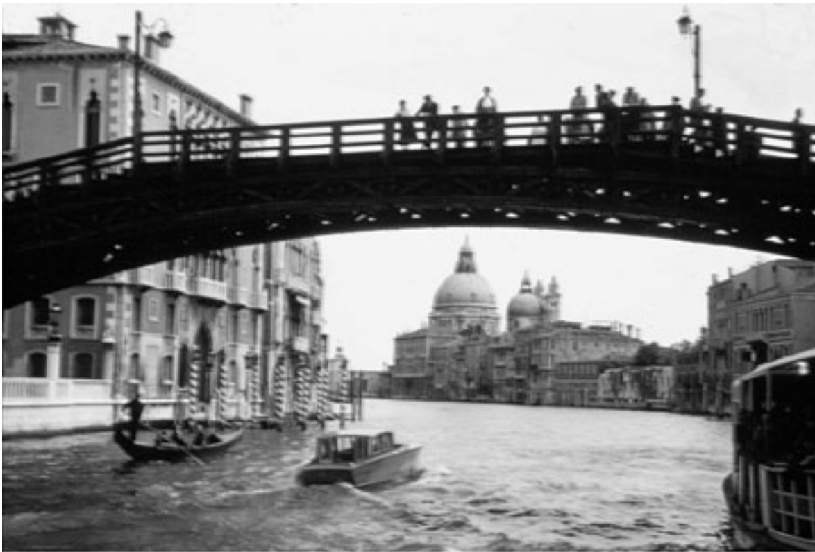
Audie Murphy Research Foundation

I remember one day I didn't have to work, so I remained in my hotel room at the Majestic. About three in the afternoon a room clerk called to politely inquire when I was going out. I didn't plan to come down for dinner until about