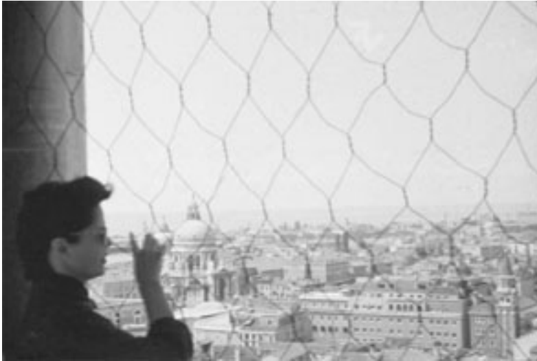
Audie Murphy Research Foundation