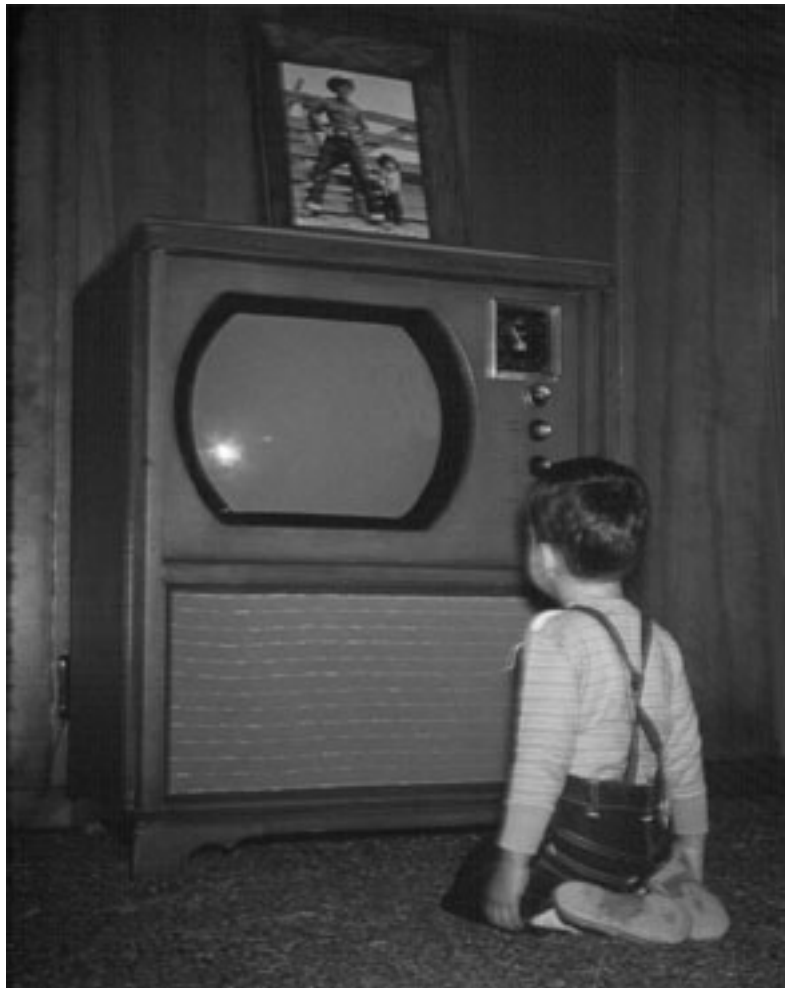
Audie Murphy Research Foundation

Already hypnotized, waiting for the light.