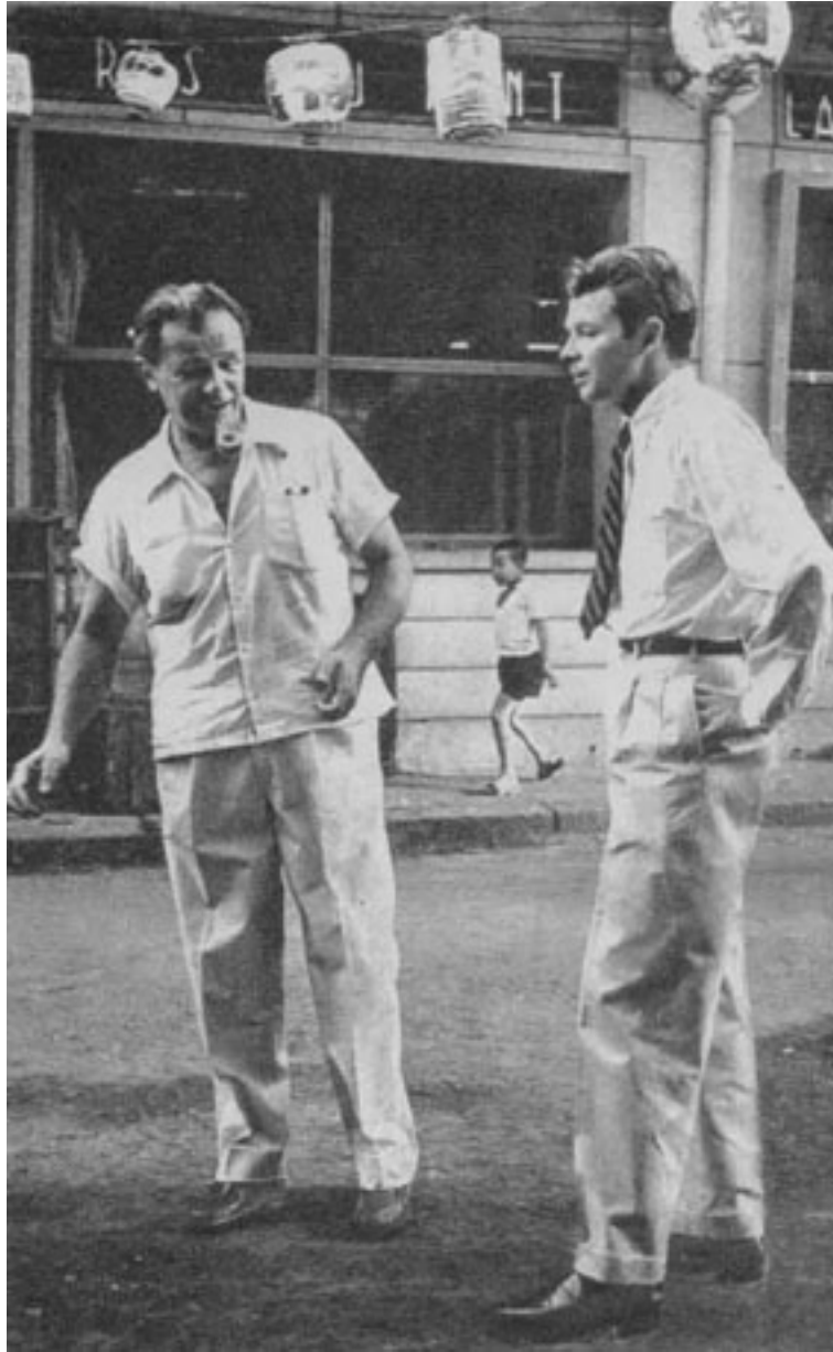
Audie Murphy Research Foundation