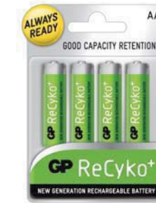
210AAHCBE-UC4 AA 1.2V Typical Capacity : 2050mAh