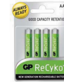
85AAAHCBE-UC4 AAA 1.2V Typical Capacity : 820mAh