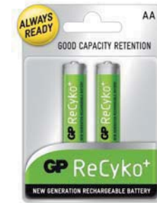
210AAHCBE-UC2 AA 1.2V Typical Capacity : 2050mAh