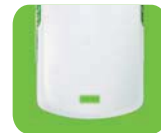
LED glow underneath