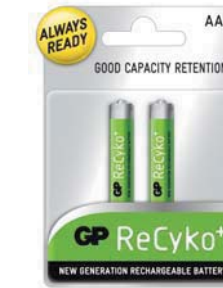
85AAAHCBE-UC2 AAA 1.2V Typical Capacity : 820mAh