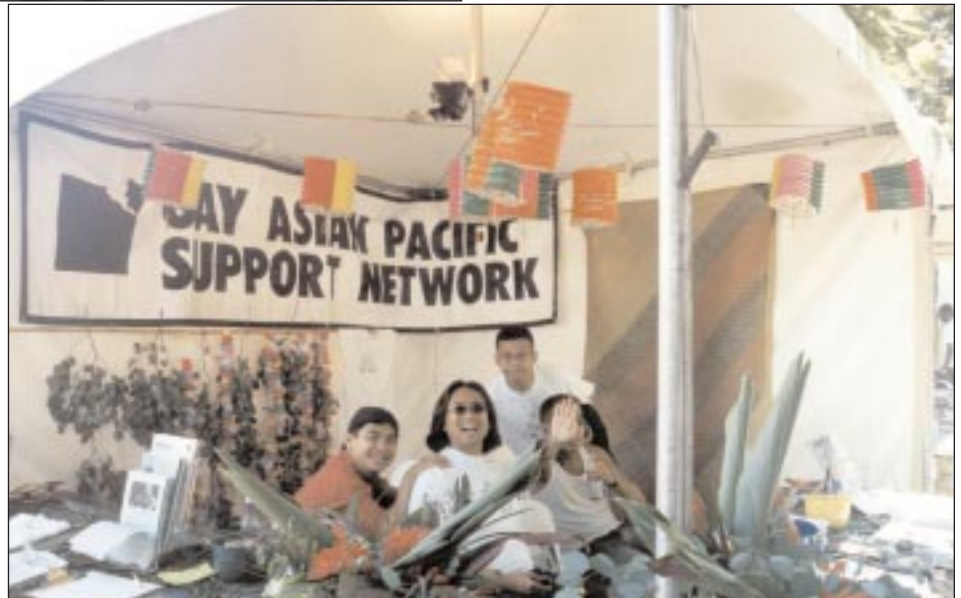
Los Angeles Pride ↑