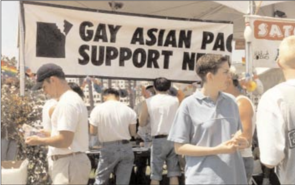
Long Beach Pride ↑

G APSN was proud to staff a booth at the Long Beach Pride Festival. Long Beach Pride has always been a sponsor of GAPSIN and we were pleased to enter a different part of town. This was the first booth we've ever had in Long Beach. Adorned with an Pacific Island motif, we were warmly greeted by the crowds and had many sign-ups. We were very successful and look forward to returning next year.