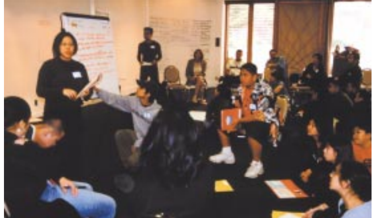
Youth & providers collaborating in a break-out session.

continued from pg.1 "Meeting at the Crossroads"