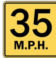
W13-1 Advisory Speed Plaque