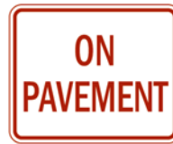
R8-3c Supplemental Plaque