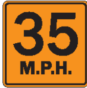
W13-1 Advisory Speed Plaque