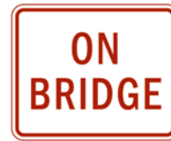
R8-3d Supplemental Plaque