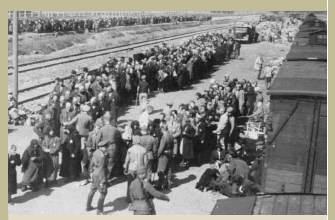
Members of the SS separate Hungarian Jewish men from women and children upon arrival at the Auschwitz-Birkenau killing center in Poland. After separating the victims by gender, the SS selected individuals for either forced labor or murder in gas chambers. (spring 1944)