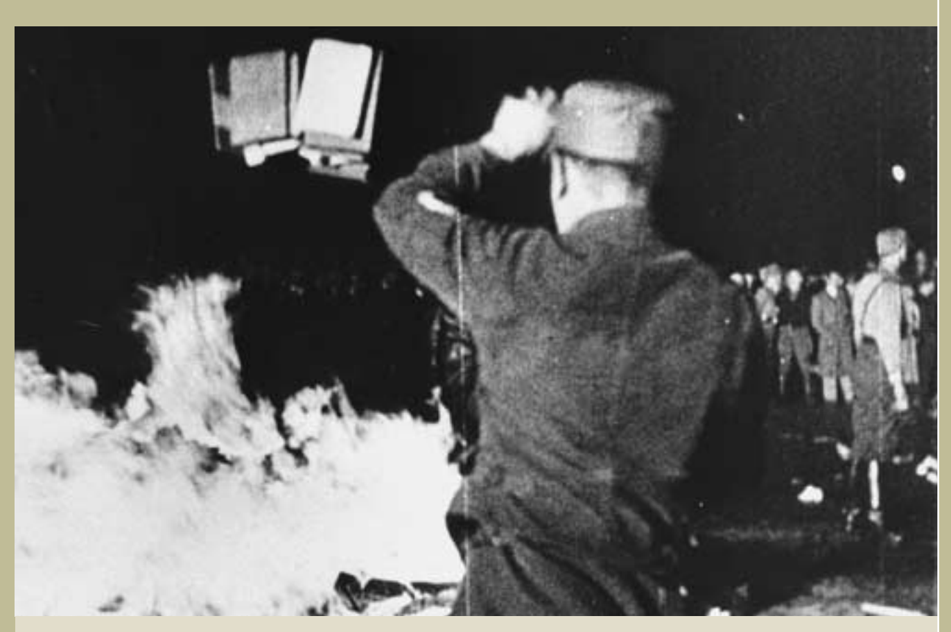
A member of the SA throws confiscated books into a bonfire during the public burning of "un-German" books in Berlin, Germany. (May 10, 1933)