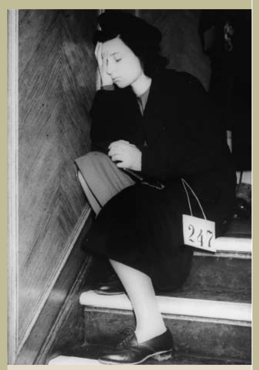
A Jewish girl from Vienna sits on a staircase after her arrival in England. Nearly 10,000 children found refuge in England in what was called the Kindertransport. (December 12, 1938)