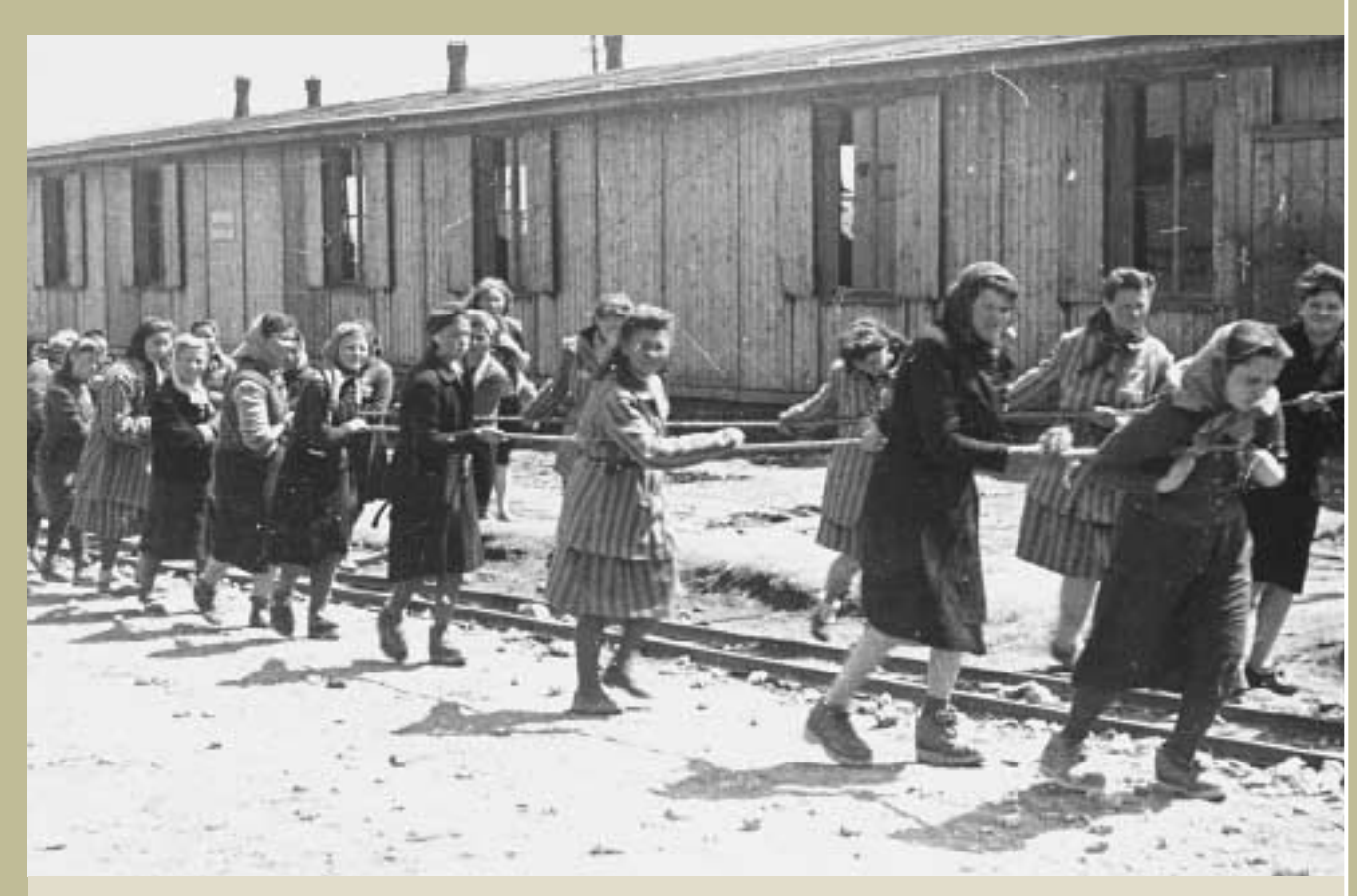
Prisoners perform forced labor in the Plaszow concentration camp in Poland. (ca. 1943–44)