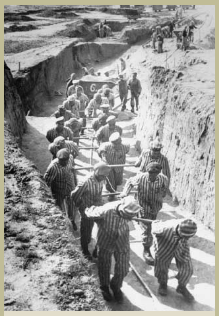
Under SS guard, prisoners perform forced labor in the Mauthausen concentration camp in Austria. (1942)