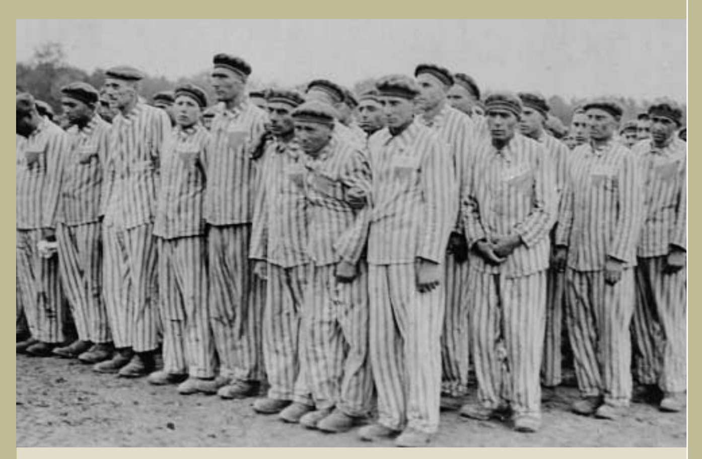
Prisoners stand during a roll call at the Buchenwald concentration camp in Germany. (ca. 1938–1941)