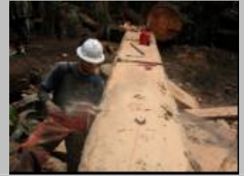
Your Fees At Work: PNTA building new footlog across Greenwater River, Snoqualmie District .