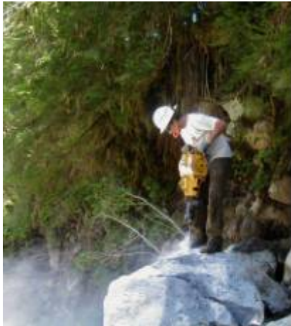
Worker repairs flood damage on the Baker Lake Trail.