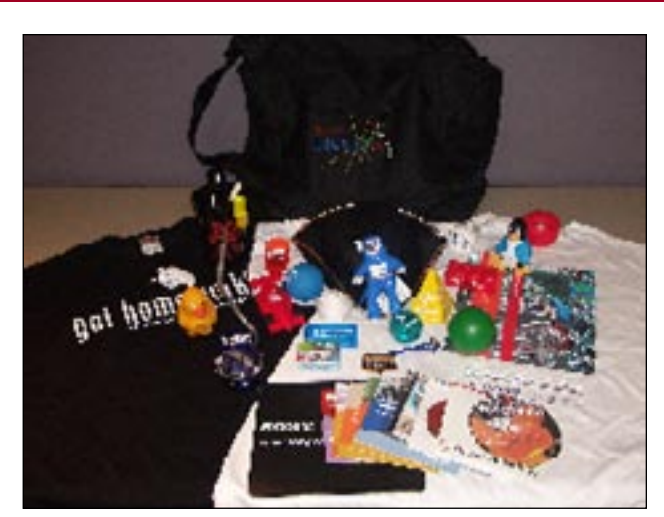
In addition to the usual pile of pens, forest of notepads, feast of candies and mountains of free software, this year's NECC exhibit booths featured a wide variety of stress sponges, from race cars to building blocks. T-shirts also featured prominently. The folks at HotChalk gave away 2,240 black tees during the first three days of the show.

—Compiled by Davis N. Smith and Jennifer Roland