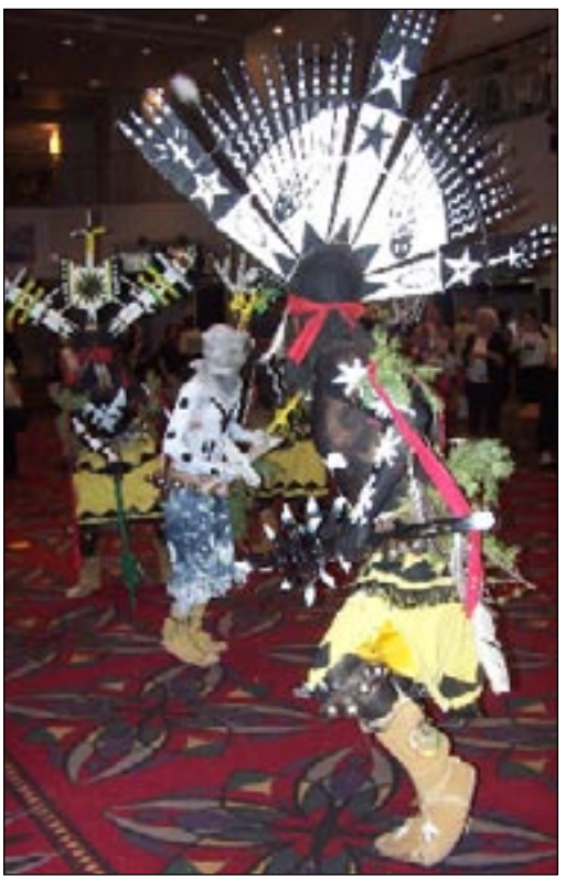
The Crown Dancers from Theodore Roosevelt School drew a crowd of onlookers as they performed their sacred