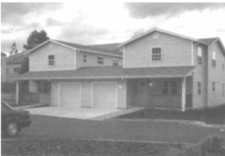
A portion of Clark County's document recording fee will fund operating and maintenance for YW Housing's shared homes for recently homeless or incarcerated women and their children.