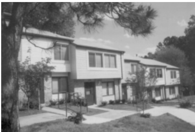
Montgomery County renovation of affordable housing.