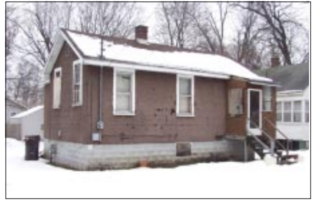
An example of many homes in Kalamazoo that are vacant and in need of rehabilitation.

campaign continues with future plans for more meetings, continued education, accountability sessions and more. Working to draft a proposed ordinance, MOP is not leaving anything to chance. ■