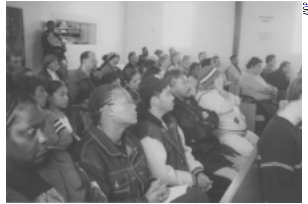
Michigan Organizing Project members at a City Commission meeting.