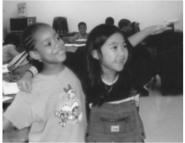
The Housing Initiative Fund helps fund Montgomery Housing Partnership efforts to make apartment buildings feel more like communities. The homework club at Great Hope Homes allows children to focus on their studies as well as develop relationships with their neighbors.

Apartment Assistance Program is a unique partnership between Montgomery County's Department of Housing and Community Affairs and the Montgomery Housing Partnership, a nonprofit that acquires, rehabilitates and provides services at affordable housing developments throughout the County. This multifaceted program includes: seminars and round tables for apartment building owners; a grant program to help defray the cost of lead-based paint testing; and intensive coordination and administrative support for revitalization and cooperative purchasing efforts in targeted neighborhoods. Funds also supported Casa de Maryland, a nonprofit that works to build community across jurisdictional and cultural lines. Casa de Maryland opened a com-