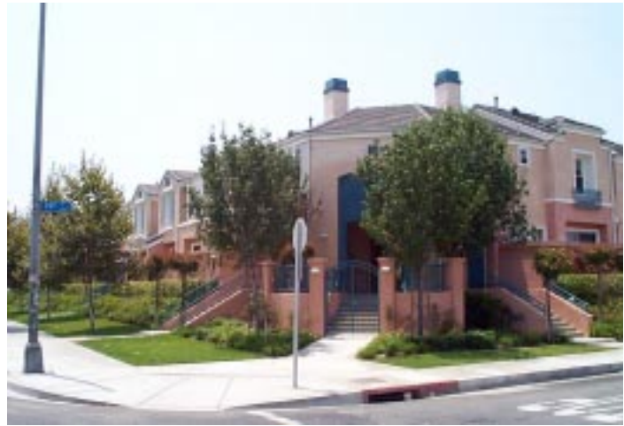
Atlantic Villas is an example of affordable housing in Long Beach.

Nearly one-fourth of Long Beach renters spend more than half of their income on rent. And Long Beach has the lowest vacancy rate in Los Angeles County, hovering at 3.7% and expected to drop to 3% in 2004. One-fifth of Long Beach