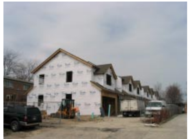
CITY OF HIGHLAND PARK

The Affordable Housing Trust Fund is administered by the City's Housing Commission. The Housing Commission is assisted by a seven-member Advisory Committee, appointed by the Mayor, with the advice and consent of the City Council. The Advisory Committee serves as a recommending body to the Commission on all aspects of