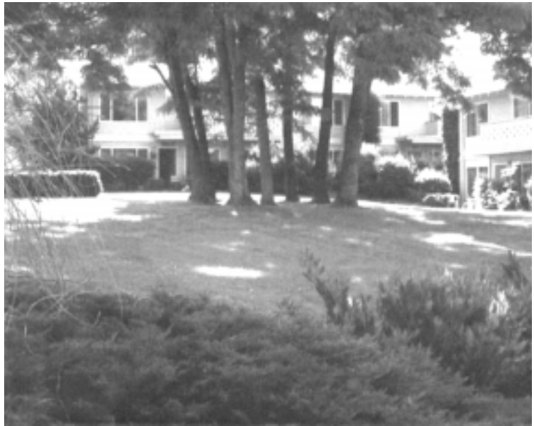
Plum Court is a 66-unit development in Kirkland (King County) sponsored by Downtown Action to Save Housing. It will provide affordable housing for nine people with developmental disabilities.

FY2004 budget allocates $1 million to be restored to the Housing Opportunity Fund. It is also anticipated that the Fund will receive $3.8 million from H.B. 2060 funds.