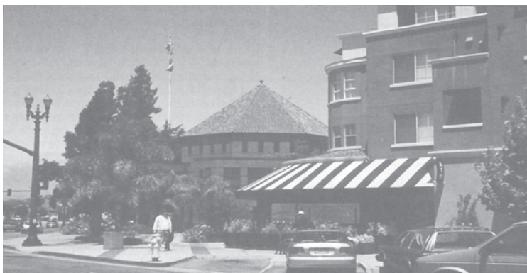
This smart growth development in Redwood City Center locates affordable housing near transit and commercial amenities.