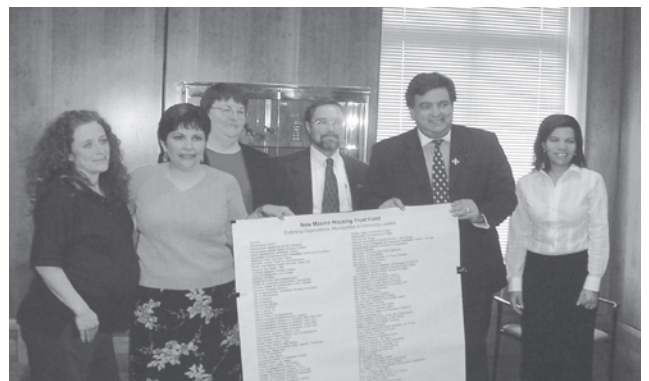
Coalition members pose with Governor Richardson at signing of the Housing Trust Fund legislation.