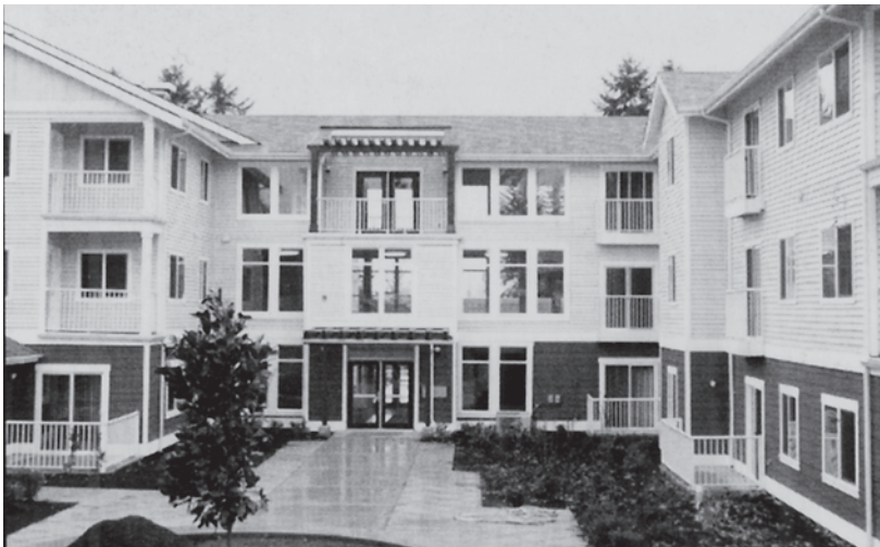
Mitchell Place in Federal Way was developed by Multi-Service Center and provides 50 units of affordable housing for seniors.

HOUSING DEVELOPMENT CONSORTIUM OF SEATTLE-KING COUNTY