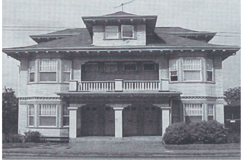
Windermere House is a four-plex for transitional housing developed by Seattle Emergency Housing Service.

Funds from the Homeless Housing Account may be used to assist homeless individuals and families gain access to adequate housing, prevent at-risk individuals from becoming homeless, address the root causes of homelessness, track and report on homeless-related data, and facilitate the movement of homeless or formerly homeless individuals along the housing continuum