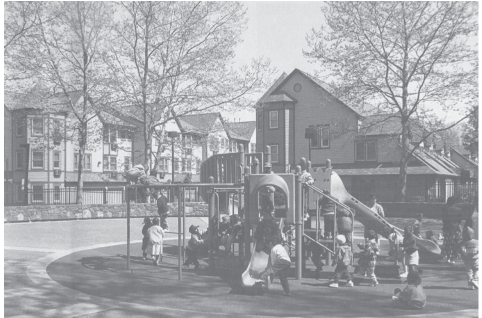
Carwin Park serves residents of Parkside Gables--the first mutual housing community built in Connecticut.

in 2000 estimated the shortfall of affordable housing in the state at 68,000 units. Studies by the Connecticut Housing Coalition, the Business Council of Fairfield County, Southeastern Connecticut Council of Governments, Regional Plan Association of New York, New Jersey and Connecticut, and Lower Naugatuck Valley Regional Housing Coalition, as well as numerous Connecticut-based economists, have cited both the significant need for affordable housing and the economic ramifications of the lack of sufficient housing.