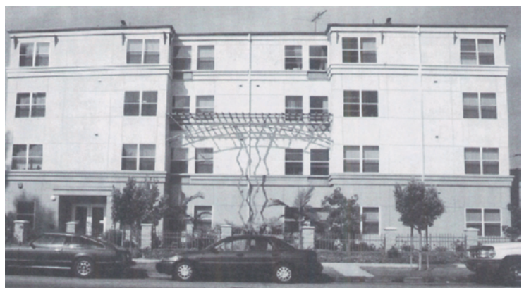
The Homes for Life Foundation developed Palms Court to address the dire need for affordable housing for people with chronic mental illness on the west side of Los Angeles County.