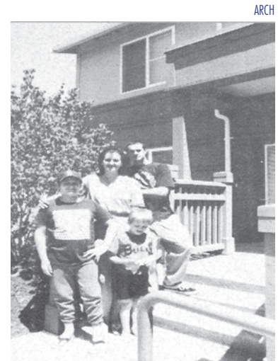
Easternwood Apartments in Bothell are owned and operated by Lutheran Alliance to Create Housing.

The Housing Trust Fund was created in 1993 as a way to directly assist the development and preservation of affordable housing in East King County. The trust fund is capitalized by both local general funds and locally controlled, federal Community Development Block Grant funds. The trust fund process allows ARCH members to jointly administer their housing funds and assist the best available housing opportunities that meet the housing