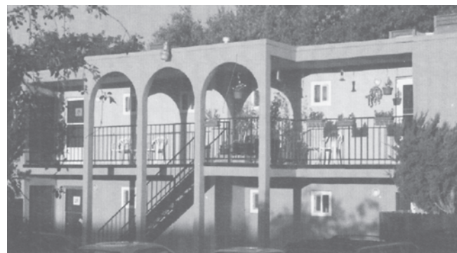
Sandpiper Apartments in Albuquerque provides 235 apartments for those earning less than 60% of median income.

The Committee will develop an application and review process that encourages applicants to develop solutions that are responsive to local needs and are consistent with sound housing policy. The Committee will make recommendations for funding and is responsible for ensuring that the total funds awarded attract at least three times as much funding from other sources. Funds will be awarded on a competitive basis.