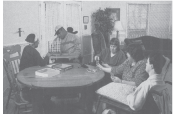
Second Avenue Home in Gastonia serves people with traumatic brain injuries.

The Housing Trust Fund is the most flexible housing dollars available to North Carolina. The Fund supports four programs: rental production, supportive housing development, urgent repairs, and a self-help housing loan pool. As of the end of 2004, the trust fund has financed 15,000 homes and apartments, including: more than 1,500 units of supportive housing for mental health clients, victims of domestic violence and others; emergency repairs and accessibility modifications that enabled 5,500 very low income homeowners to continue to live safely at home after strokes and