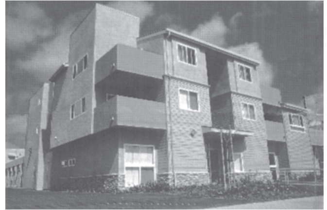
Casa Alegre is a 23 unit building serving homeless people living with HIV in Anaheim. The project provides supportive services to residents including counseling, a food pantry, and health education as well as full access to a built-in entertainment center. Co-developers are Mercy Housing California and the AIDS Services Foundation of Orange County.

More than a year ago, the Anaheim City Council passed the Affordable Family