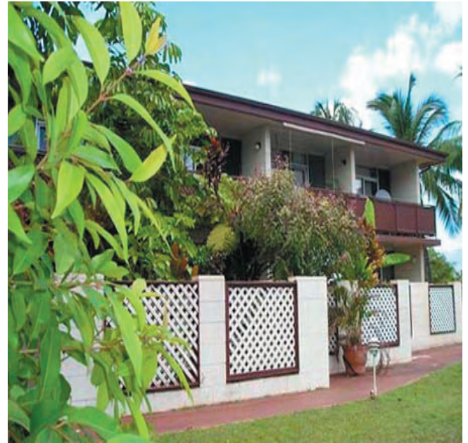
Hale Lokabi Elua is an affordable rental apartment complex developed for renters on the island of Maui whose incomes do not exceed 50% of the county median income. Hale Lokabi Elua was developed by Lokahi Pacific.

Among the other changes passed in the bill are: (1) priority for funding is given to projects or units that are allocated low income housing credits and mixed-income rental projects available to households whose income does not exceed 140% of the median family income; (2) over the next two years, the extent to which housing is provided for those making less than 30% of median family income will be assessed as an effective use of the fund; and (3) the Housing and Community Development Corporation will be separated into two entities, one