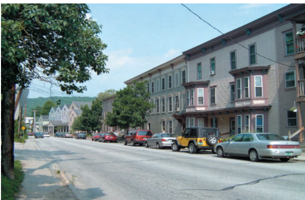
North Branch Apartments on Elm Street in Montpelier are available from the Central Vermont Community Land Trust.