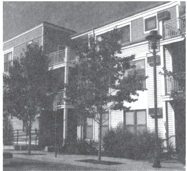
Auburn Court in Cambridge.

to the Affordable Housing Trust Fund. In 2003, the City raised the housing contribution to $3.86 per square foot of development and is currently seeking to increase the rate to $7.83 per square foot after completing a recent study that re-evaluated the program. Last year, the Fund received $918,468 in linkage payments. The Community Development Department anticipates that the City will receive housing contribution payments exceeding $2.5 million over the next 5-7 years.