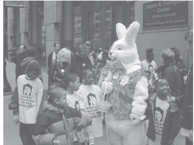
The Easter Bunny joins homeless children in delivering an Easter basket to the Speaker of the House to encourage him to allow the Rental Housing Support Bill to move forward.