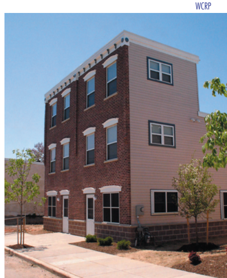
The Karen Donnelly Townhouses was completed in 2005 by the Women's Community Revitalization Project in Philadelphia.

Housing advocates in Philadelphia have long recognized severe housing problems in the City and called for increased funds. The crisis was thoroughly documented in early 2003, when the Philadelphia Affordable Housing Coalition released "A Call to Action: Philadelphia's Affordable Housing Crisis and What We Can Do About It." In May 2003, the Philadelphia Association of CDCs (PACDC) released "Invest in Neighborhoods: An Agenda for Livable Philadelphia Communities," which called for the creation of a $15 million annual housing trust fund, among other initiatives and committed to a major advocacy effort to reach this goal.