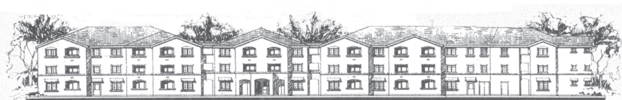
Vintage Zinfandel in Santa Rosa will provide 129-senior rental apartments for working or retired, low and very low income seniors. Northbay Family Homes partnered with USA Properties Fund for this development.