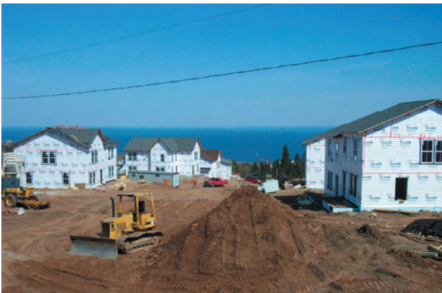
Harbor View in Duluth is an affordable housing project of the Local Initiatives Support Corporation.