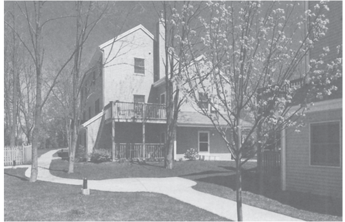
Flagg Road was built in West Hartford by the Interfaith Coalition, Inc. and provides housing for low and moderate income households.

“At Home in Connecticut” has been a campaign of the Women’s Institute for Housing & Economic Development, the Connecticut Housing Coalition, Fannie Mae, Local Initiatives Support Corporation, Partnership for Strong Communities, and the