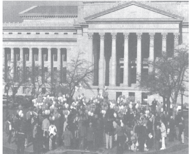
Housing Advocacy Day in Olympia, Washington.