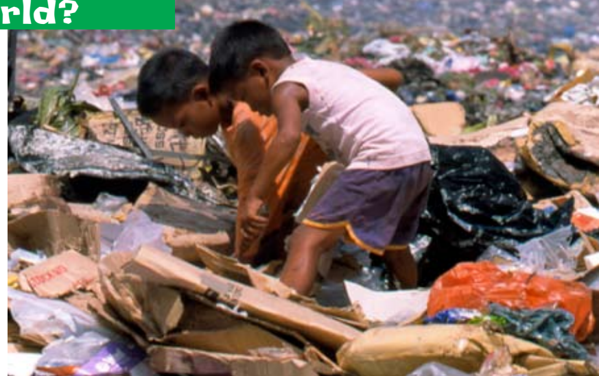
Dump-dwelling kids dig through trash in Davao, Philippines. Below: A Filipino girl looks out of the window of her handmade tin house.

Pray that Christians everywhere will learn more about "children at risk" and want to get to know, help, and pray for the<mark>m.</mark>