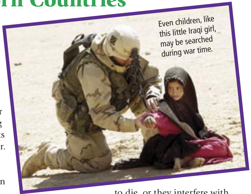
Even children, like this little Iraqi girl, may be searched during war time.

Besides fear and hatred, war also creates poverty, hunger, disease, and environmental hazards. All of these things cause more children