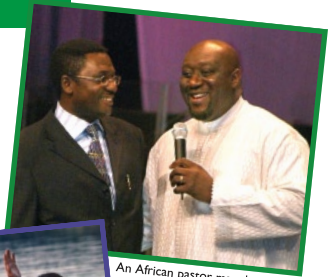
An African pastor may dress differently than your pastor does.

Whether the pastor is in a large or small