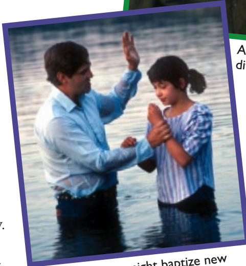
An Asian pastor might baptize new believers in a lake or stream.

congregation, in the big city or a tiny village, or married or single, every man or woman God has called to be a pastor must have prayer support from other Christians.