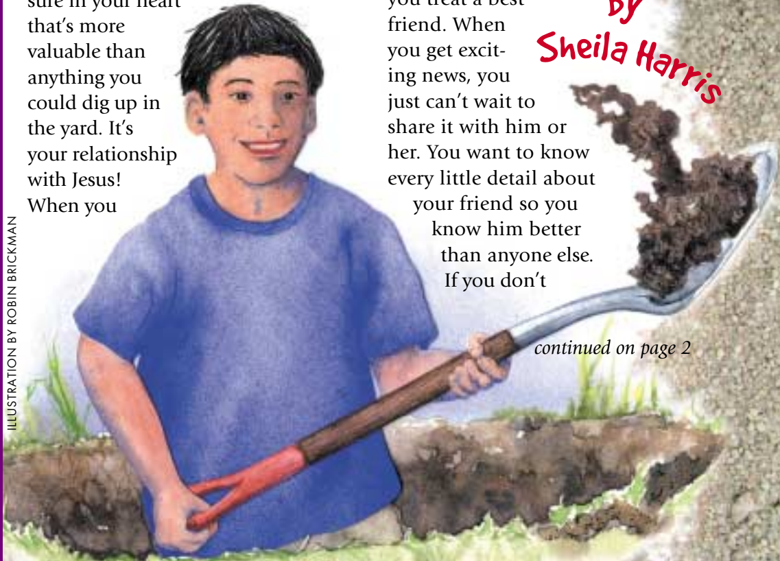
ILLUSTRATION BY ROBIN BRICKMAN