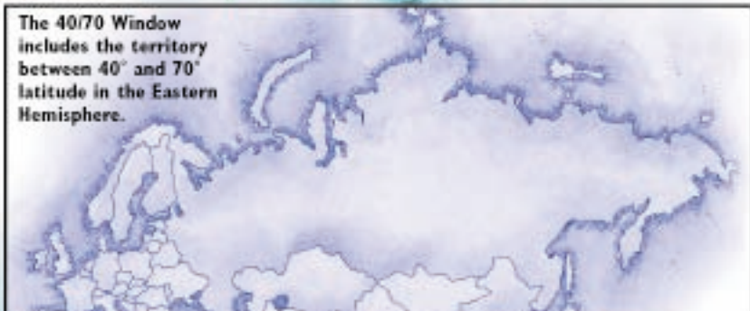
The 40/70 Window includes the territory between 40° and 70° latitude in the Eastern Hemisphere.

Since 1989, millions of Christians all over the world have been praying for the 10/40 Window.