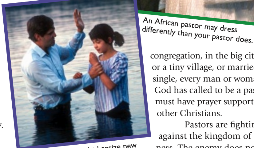
An Asian pastor might baptize new believers in a lake or stream.

Whether the pastor is in a large or small