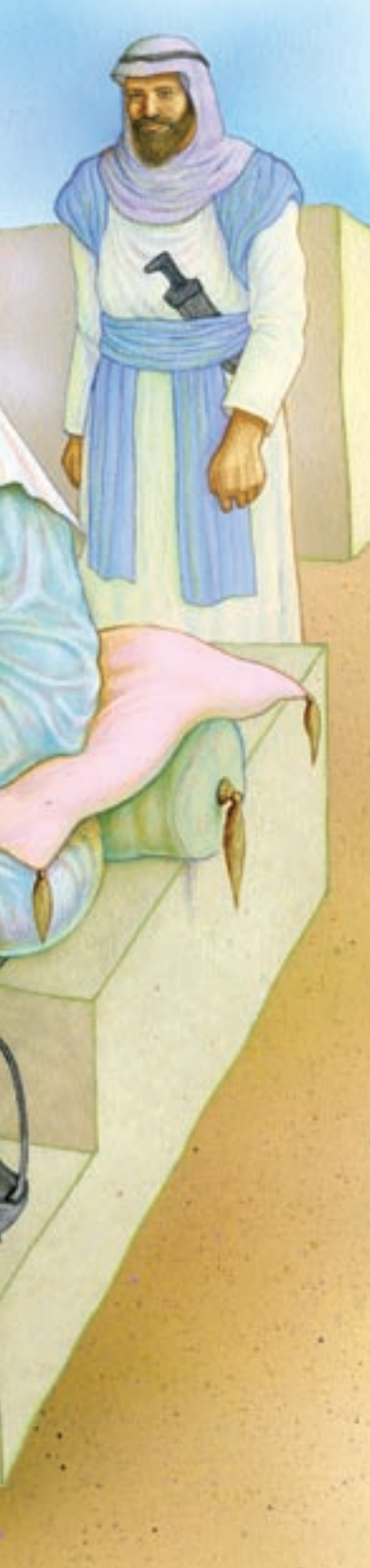
Approaching, Mara straightened her shawl over her dark hair. "Ikkesh, sir," she said. "Please help. That wicked man has come again."

Ikkesh laughed. "What do I care? That is your problem!"