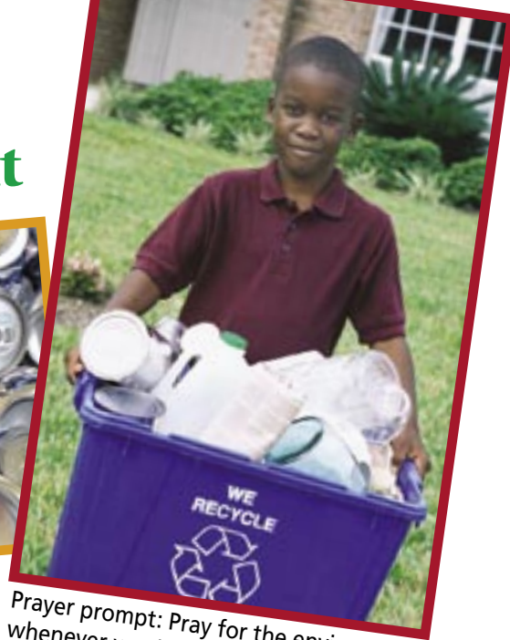
Prayer prompt: Pray for the environment whenever you help with recycling

environment each time you put a newspaper or aluminum can in the recycling bin. Or you can pray each time you drink a glass of clean water or take a shower.