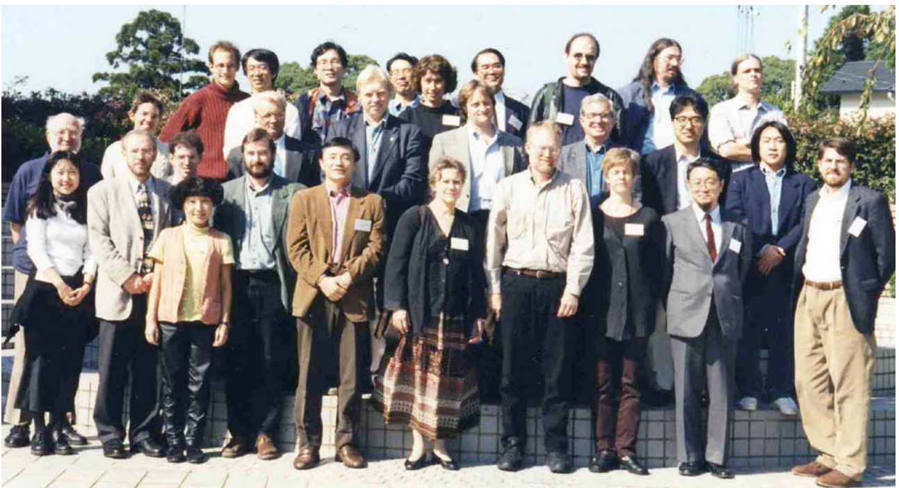
Participants in International MOX Assessment Interim Report Public Meeting, Kyoto, October 1996

To our friends in the anti-nuclear movement around the world