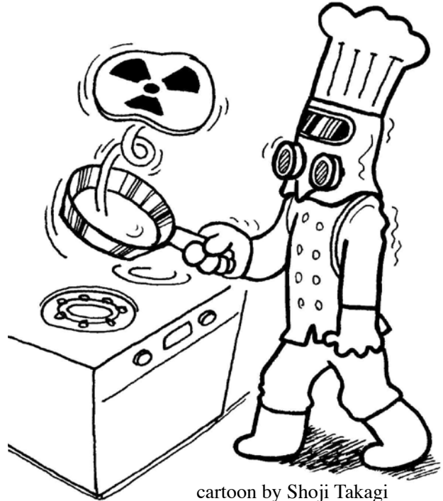
cartoon by Shoji Takagi

The basis for the calculation of the clearance level is an annual radiation dose of 10 micro sieverts. A radioactivity concentration (clearance level) is determined for each nuclide, such that in one year the exposure dose from that nuclide will not exceed 10 micro sieverts, even if the huge amount of radioactive waste generated when a reactor is dismantled is reused as metal or concrete, or even if it is buried as industrial waste