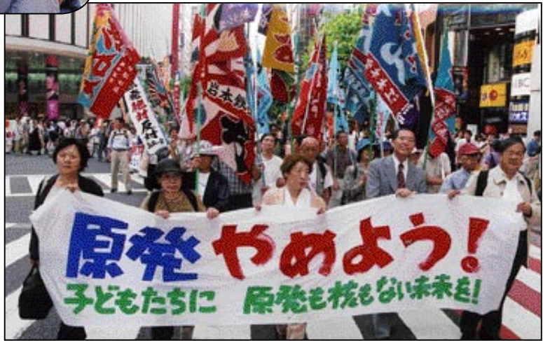
Top: Demonstration of canisters for the high level nuclear waste. Middle: The scene of demonstration walk in the center of city, the banner reads “ Give up Nuclear Power -- No Nuclear Power Plants and No Nuclear Weapons for Our Future and Our Children”