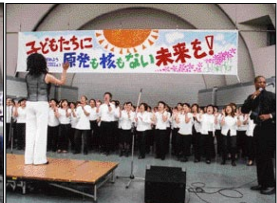
Left and Right: Citizens group around the nation performing at the stage of Yoyogi Park