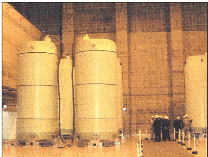
Picture 1. Some spent fuels are stored in nuclear power plants (Tokai Daini power plants),

Source: Ministry of Economy, Trade and Industry