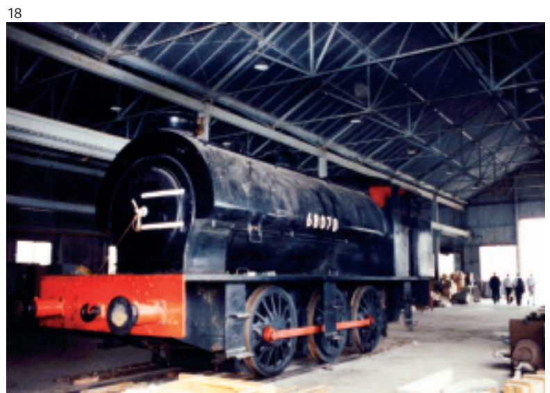
18 The Southall railway steam engine in 'W' building

However, in 1949 tenure of the shelters was prematurely cut short or threatened. With much difficulty and delay more permanent quarters were sought and eventually found in 1950 at Hayes. The buildings on the Hayes site (at Bourne Avenue) were erected in 1941 and 1942 as a Royal Ordnance factory (ROF). They included a hospital and some living quarters (production went on 24 hours a day during the War). There were also some very large water tanks (for use against incendiary bombs), which by the 1980s were mysteriously full of fish! The buildings on the site were each allocated a letter as a ROF and this arrangement