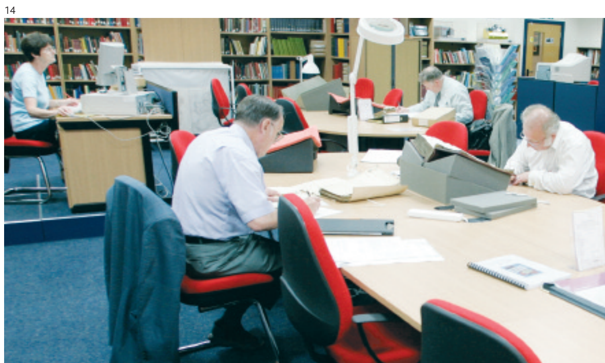
14 Visitors using the Royal Mail Archive Search Room