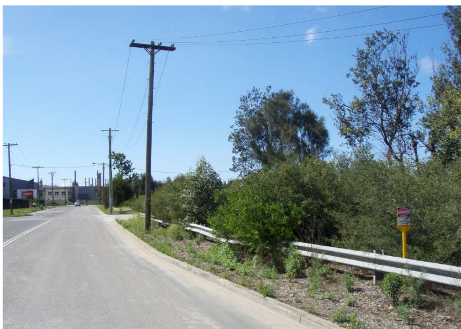
Sir Joseph Banks Drive