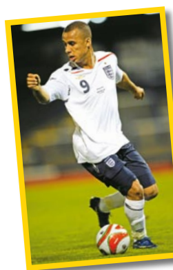
From left to right: Gabriel Agbonlahor, England, Mario Balotelli, Italy and Bojan Krkić, Spain.

“That was more than sixteen years ago, but I still remember it. Wearing the national team jersey and facing the best opposition is a big thing for all players. I don’t think it’s any different today. All players coming to Sweden in the summer are established and successful players, so it’s going to be a very exciting tournament to follow. Our guests will be coming to Sweden at its most beautiful, around Midsummer. The pitches will be in perfect condition – so welcome here!”