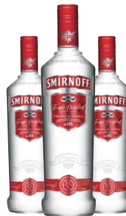
Smirnoff® Premium Vodka

Smirnoff was first launched in Ireland in 1961. Today, it is the best-selling premium vodka in Ireland. The success of the brand continues with the introduction of a range of Smirnoff flavoured vodka: Smirnoff Vanilla twist®, Smirnoff Raspberry twist®, Smirnoff Citrus twist® and Smirnoff Orange twist®.