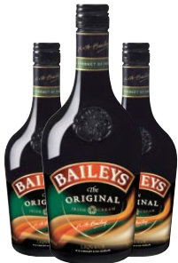
Baileys® Original Irish Cream

Baileys Original Irish Cream's rich marriage of fresh dairy cream, Irish whiskey, finest spirits and natural flavours provides a luxurious drinking experience. The great taste of Baileys Original Irish Cream is fundamental to its success, giving consumers the chance to indulge in a sensuous pleasure.