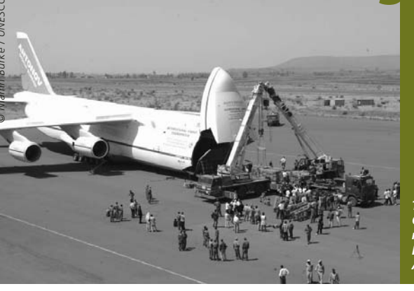
The Aksum Obelisk returned to Ethiopia in

Major archaeological vestiges have been discovered at the World Heritage site of Aksum, Ethiopia by the experts UNESCO sent to survey the World Heritage site and to prepare for the elevation of the Aksum Obelisk at its original location. The last segment of the 160-tonne 24.6-metre high stela has arrived in Aksum. It had been in Rome since 1937.