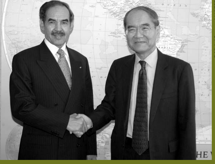
Maaouya Ould Sid'Ahmed Taya, President of the Islamic Republic of Mauritania and Koïchiro Matsuura, Director-General of UNESCO

Ediciones San Marcos Alcántara 11, 28006 Madrid, Spain tel: 34 91 431 43 19 - fax: 34 91 431 65 39 e-mail: suscripciones@ediciones-sanmarcos.com http://worldheritagereview.org