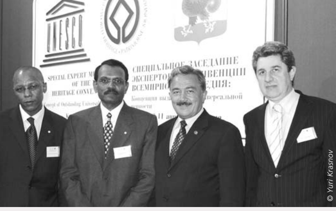
Themba Wakashe, Chairman of the World Heritage Committee; Kishore Rao, Deputy Director of the World Heritage Centre; Kamil Iskhakov, Mayor of Kazan; and Grigory Ordzhonikidze, Secretary General of the National Commission of the Russian Federation

A third group examined the sustainable conservation of World Heritage properties and what ideal management requirements in different regions are, in order to maintain the integrity and/or authenticity of the different categories of World Heritage properties.